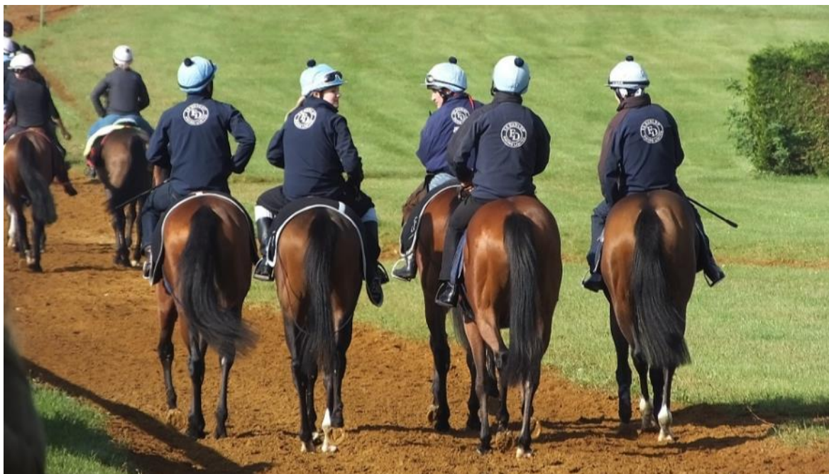
Third lot walking home.