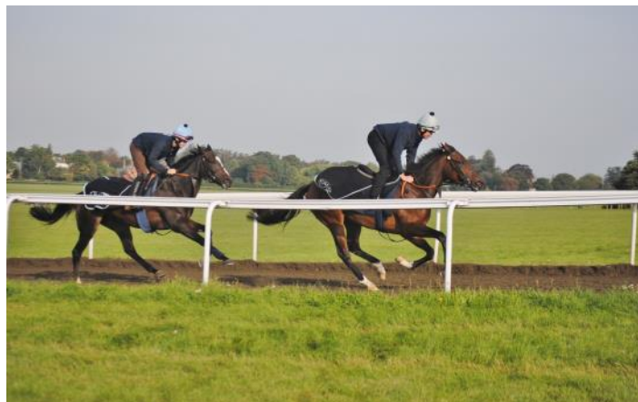
Blushes leads Dora's Field