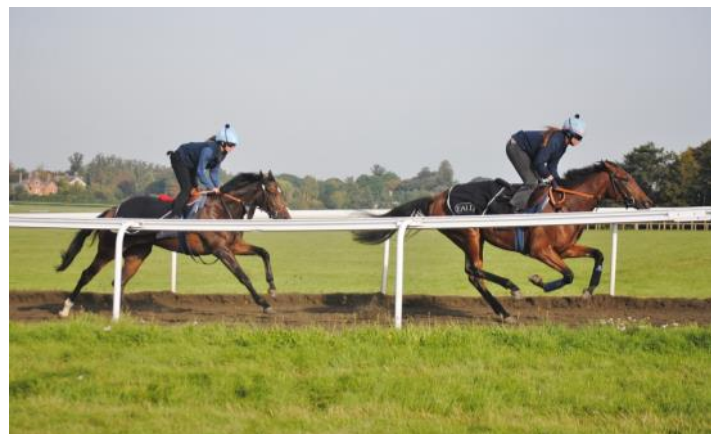
Gloryette leads Timia