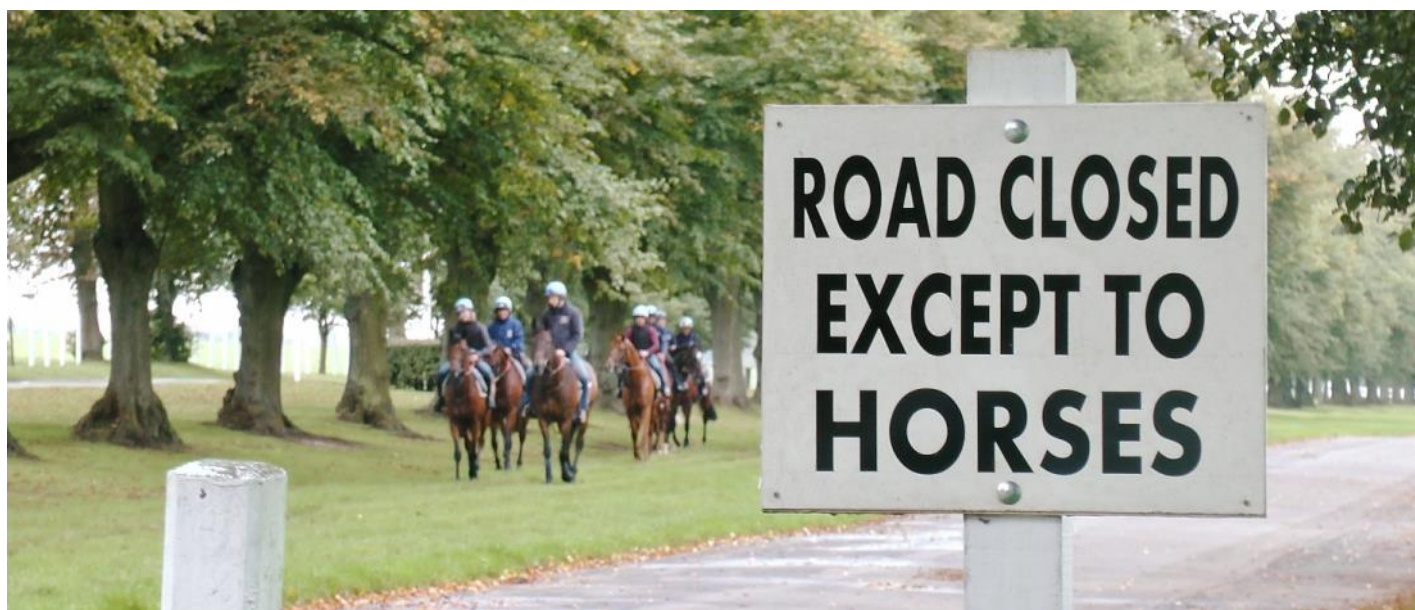
Newmarket down to a tee: there is only priority afforded around here