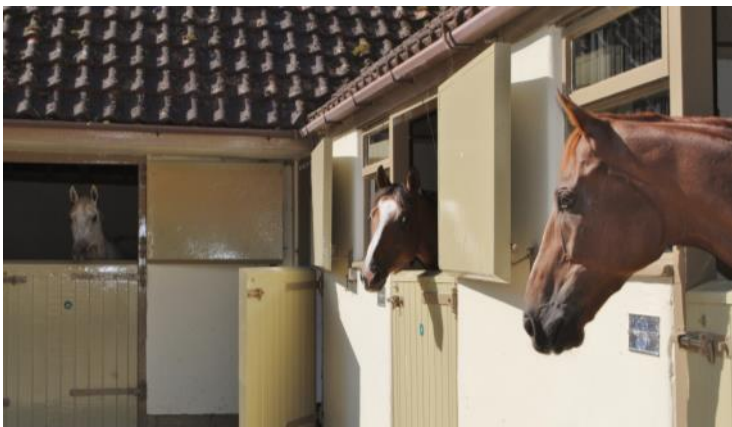
The boys settled in to quarantine at Side Hill Stud as RC talked them through what was in store for them down un-