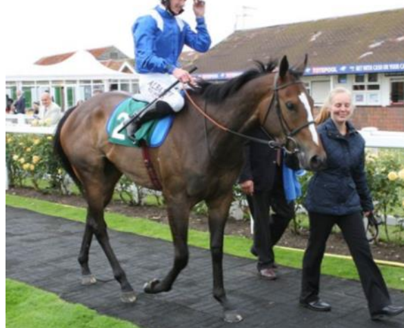
Alqubbah following her Yarmouth win