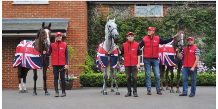
Team GBRI– Trip To Paris, Manndawi and Red Cadeaux