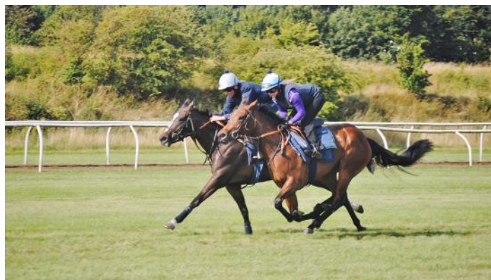
Dora's Field far side, Sagely near side