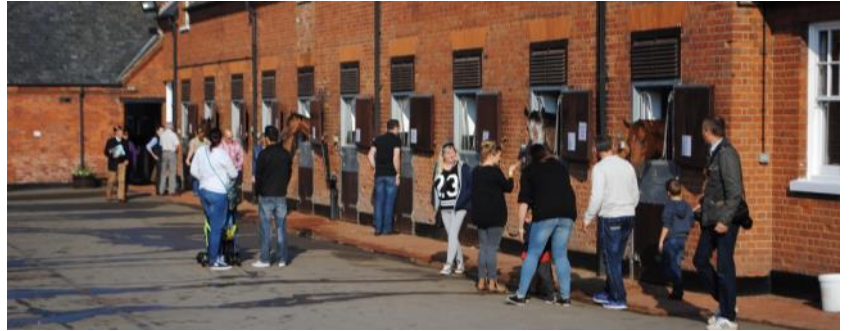
Busy around here: the horses get plenty of pats from their fans

Newmarket was transformed mid-month as the annual Open Day morphed into the inaugural Open Weekend on Saturday 19 and Sunday 20, and the crowds once again flocked into the yard on the traditional Sunday morning slot to stroke the horses and sample the fineries of the staff's baking skills.