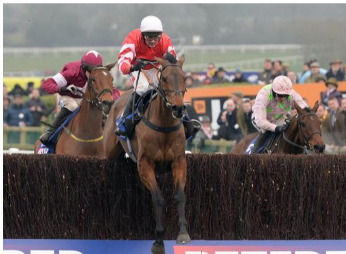
Coneygree jumps the last in the Gold Cup