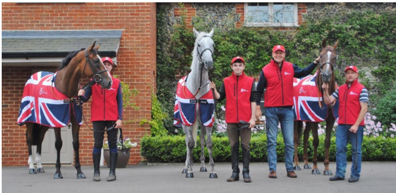
Trip To Paris, Manndawi and Red Cadeaux ready to represent Team Great British Racing in Australia