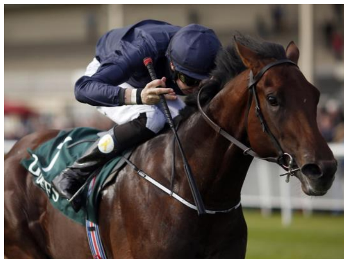
Air Force Blue: set to clash with Emotionless in the Dewhurst

particularly if the clash materialises between Champagne Stakes winner Emotionless and National Stakes victor Air Force Blue, with the winner guaranteed to be the solid winter favourite for the 2,000 Guineas.