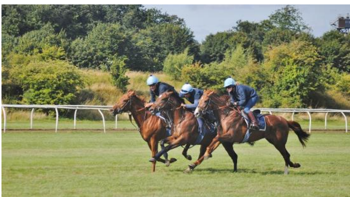
Archimento, Charioteer & Swiftee