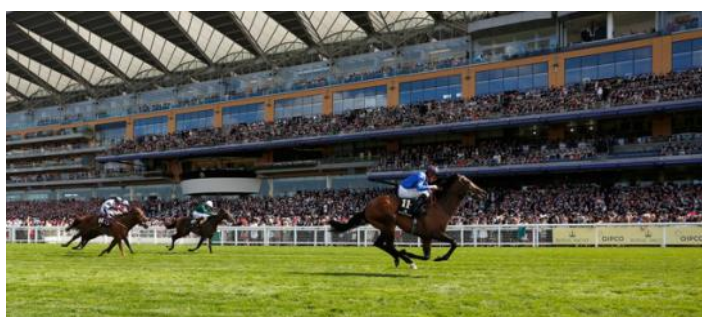
Muhaarar: bids for a fourth Group 1 win in the Sprint

The debate about the ground will never properly subside, but even the most ardent sceptic can't fail to appreciate the quality of the spectacle over the last few years. Even in the post-Frankel era the day has gone from strength to strength, and the addition of the Balmoral Handicap last year was the icing on the cake. The presence of Jack Hobbs in the Champion Stakes would be the most fascinating dimension this year, while Muhaarar will bid to close his spectacular season – and career – in the Sprint.