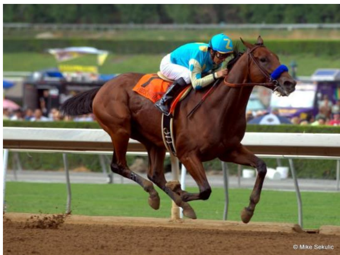
American Pharoah in full flight