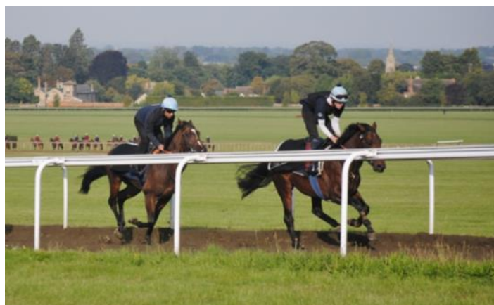
Al Hamd leads On The Bill