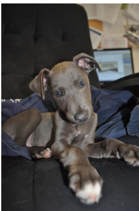
Otto continues to grow rapidly