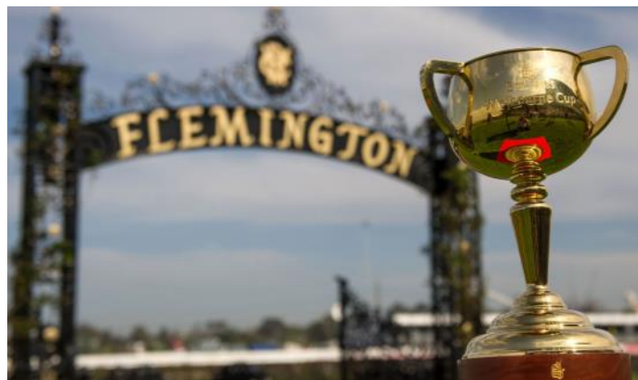
The Melbourne Cup: yet to be captured by a British-based trainer

Back in the northern hemisphere, the action comes thick and fast with all eyes on Treve at the weekend before Newmarket, Ascot and then the Breeders' Cup. We also have the small matter of the October Yearling Sales at Tattersalls to wade our way