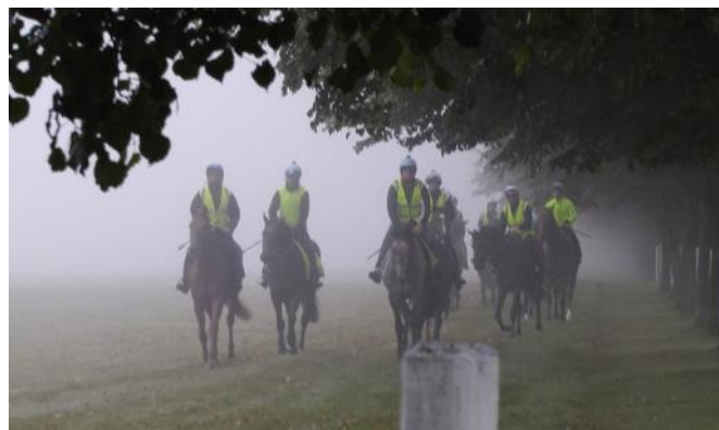
Fog looms over the workers on Racecourse Side