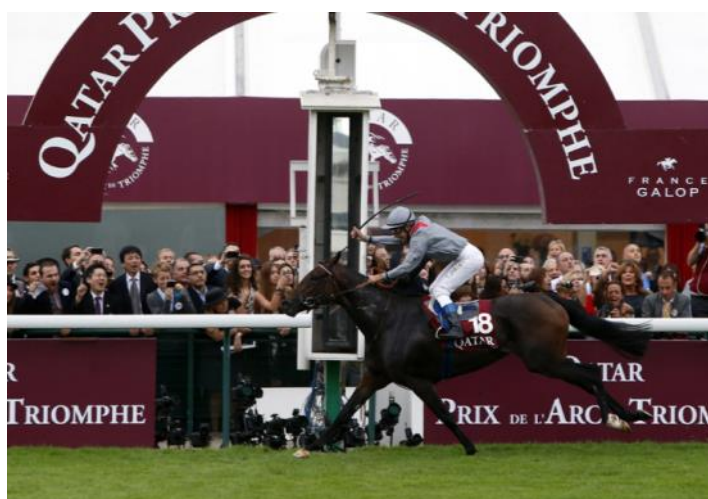
Treve: seeking an unprecedented third Arc success