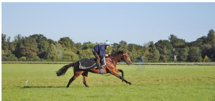
Vivre Pour Vivre