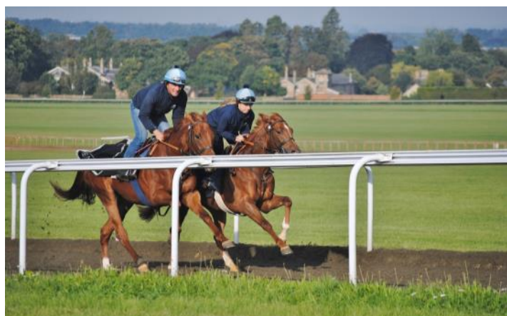
Swiftee nearside, Zauffaly far side