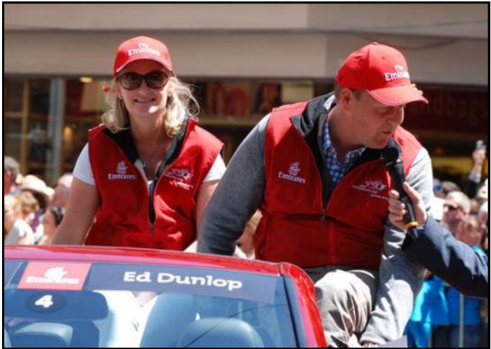
The Melbourne Cup Parade