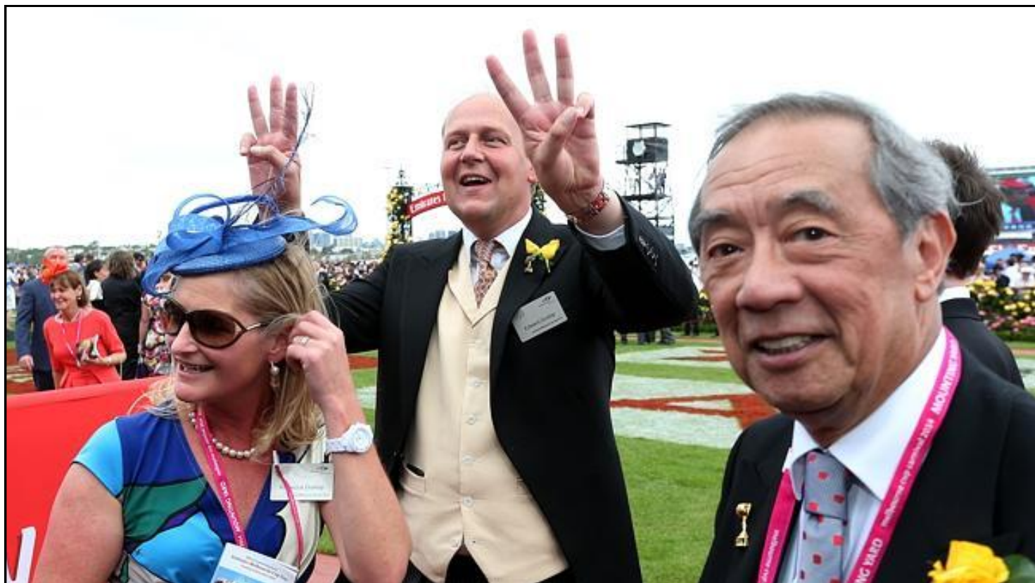
Melbourne Cup Celebrations