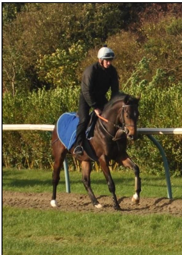
Bahamian Bounty / Little Annie Colt