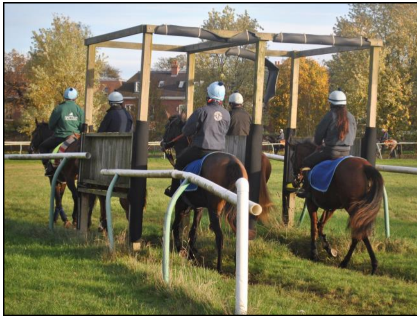
Going through the stalls