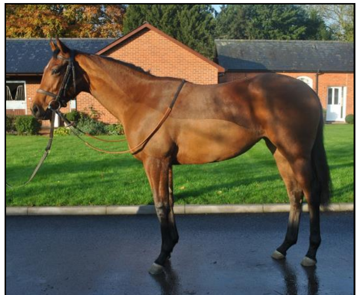
Frozen Power / Saga Celebre filly