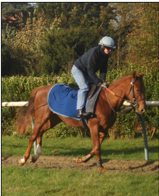
Camacho / Algaira Colt