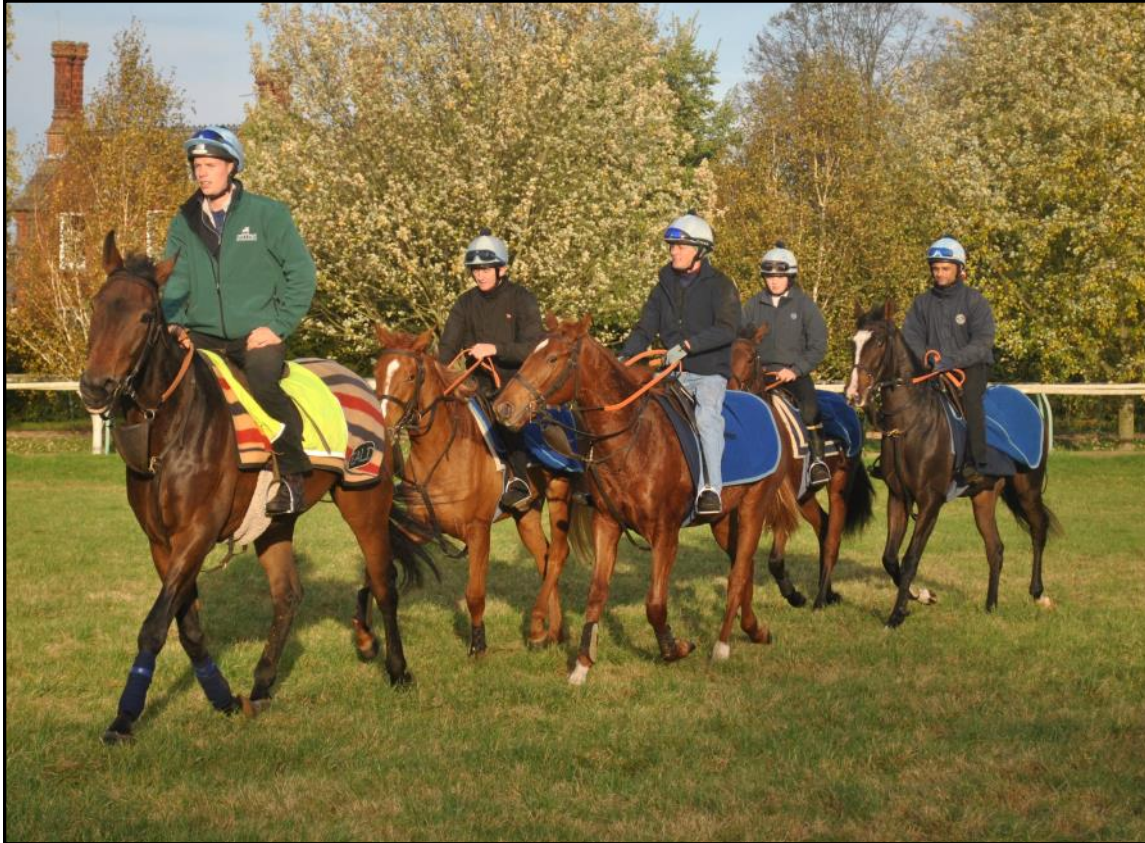
Yearlings doing trotting exercises on the heath.

We are also walking them through the starting stalls that we have at La Grange every day so that they are very used to this procedure and hopefully this will be the start of their training for their first appearance on the racecourse.