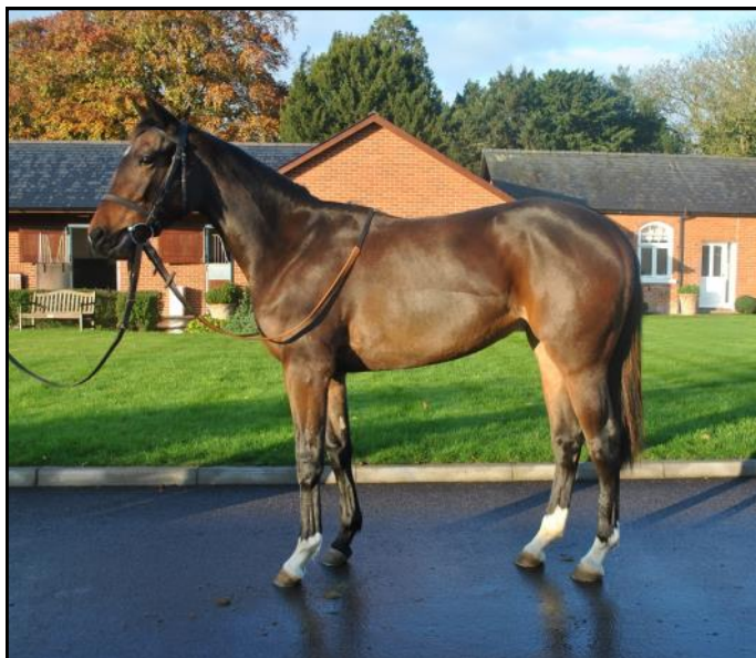
Siyouni / Pink And Red filly