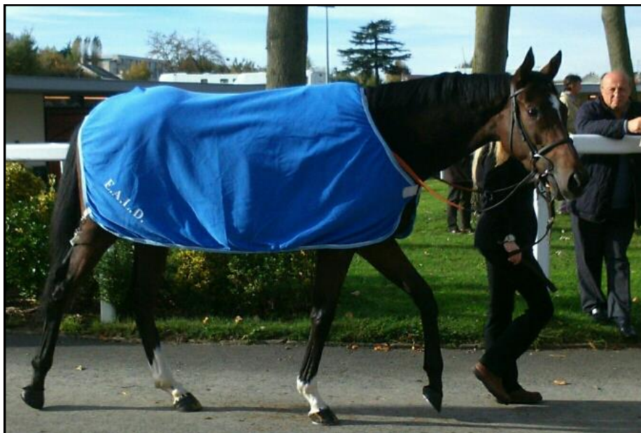
Island Remede at Saint Cloud