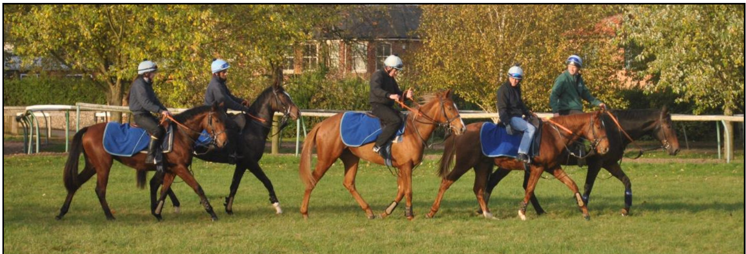
The Yearlings heading out for a canter