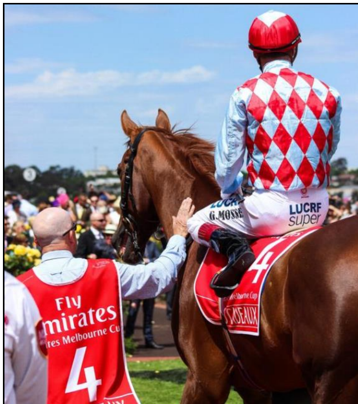
Red Cadeaux in Australia just before the race

The big day arrived and Red Cadeaux ran a cracking race, travelling beautifully and he kicked in to the lead three furlongs out and this was accompanied by a huge roar from the crowd! Sadly, however Perfectionist made up plenty of ground from the back of the field and took charge in the final furlong!