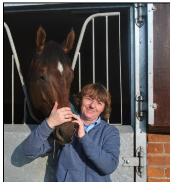
Anne Perry with God Willing