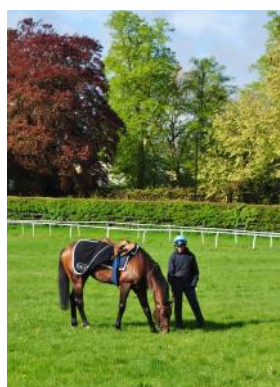
1st lot pick of grass