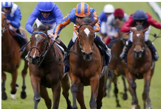
Legatissimo winning the Qipco 1,000 Guineas

Legatissimo has already proven her credentials as a Classic filly by landing the 1,000 Guineas in fine fashion.