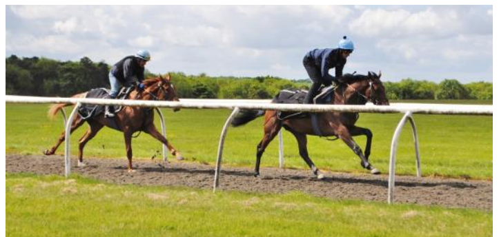
Amazing Red leads Michael's Mount

Starting stalls practice for some two-year-olds before they made their debuts this month. Kafuo, Girl With A Pearl and Hajeer jump out of the stalls for the first time: