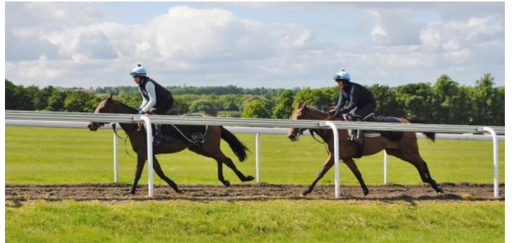
Toffee Apple leads Gloryette