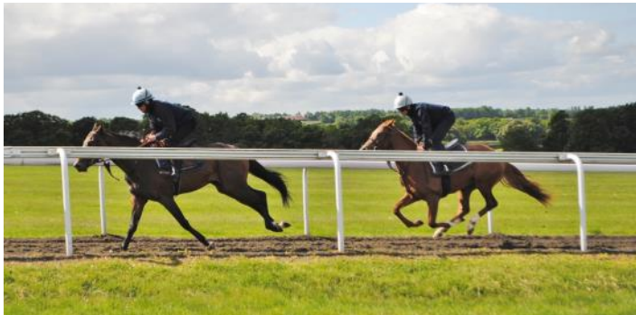
Mustatrif leads Zauffaly