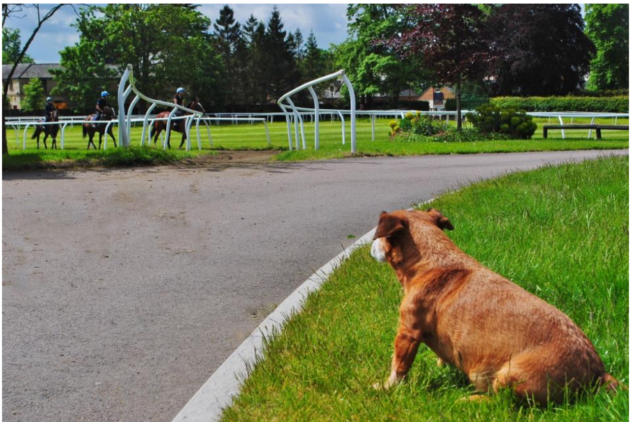
Molly watches over the two-year-olds in the outdoor trotting ring