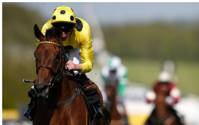
Lady Of Dubai

Still last passing the two pole, she was pulled wide by Ryan Moore and quickened past the 12-strong field within 200 yards, not needing to be fully extended to win by three and a half lengths. Neat and well balanced with a striking turn of foot, she seems to boast all of the credentials needed to triumph on the idiosyncratic contours of the Downs.