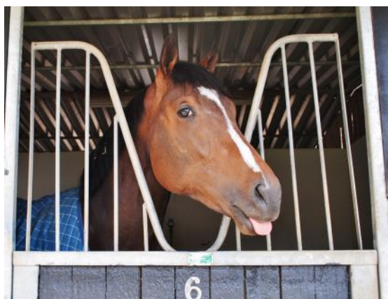
Cheeky On The Bill!