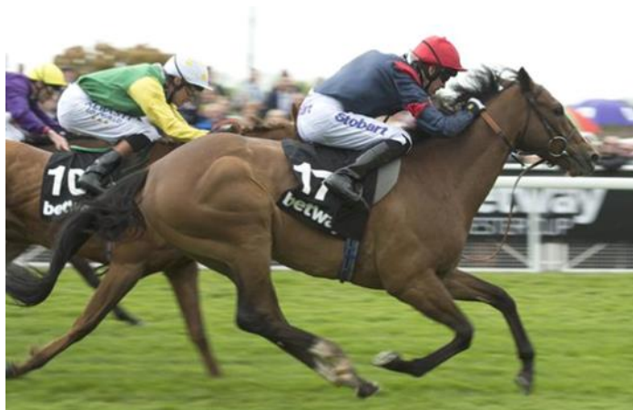
Trip To Paris staying on to win the Chester Cup.

No matter what path is pursued, TTP has proved himself a rising stayer with a turn of foot to whom all ground comes alike, and he is sure to provide the La Grange Partnership with plenty more fun this summer and beyond.