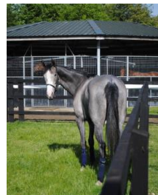
Invula turned out