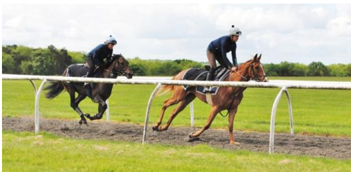
Chestnut Storm leads Blushes