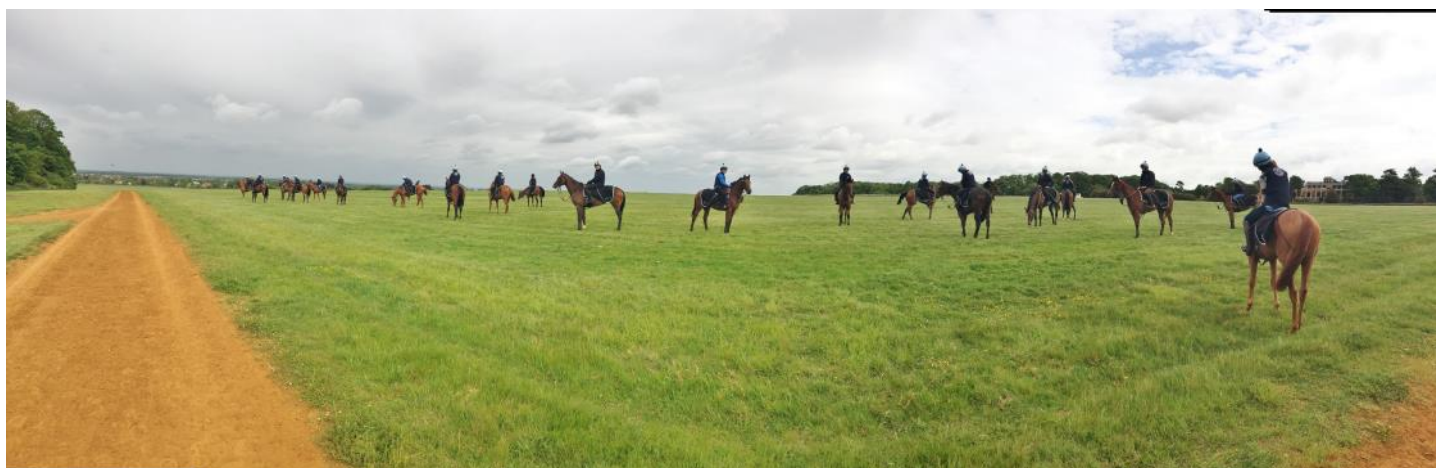
Ed's photography- two year olds picking grass on the Heath

Two countries, two very different horses and two very different races, but the premise of both the Derby and the Belmont Stakes is the same. And we, as racing fans, get to enjoy the beauty of both on the same day. Some Saturday.