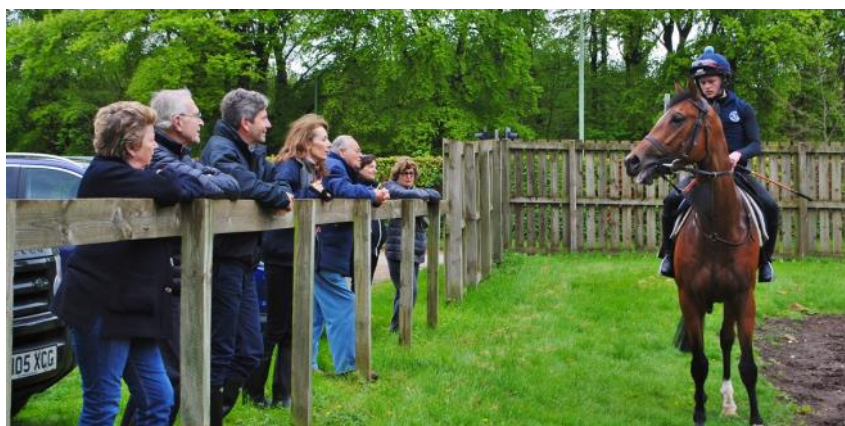
Owners admiring Field Of Light after a gallop on the Al Bahathri.