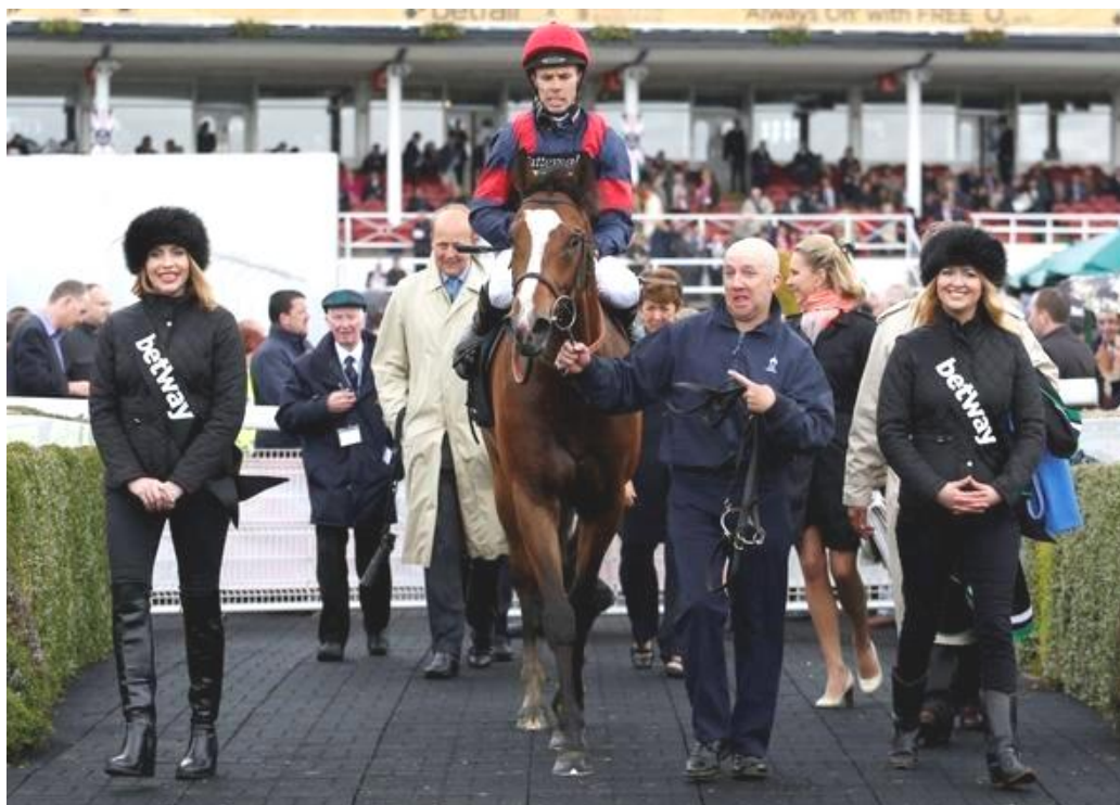
Trip To Paris and connections welcomed into the winners enclosure at Chester.