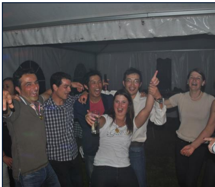
A few of our merry team!