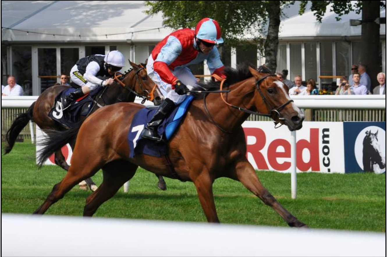
Arethusa; our first two year old winner of the season.