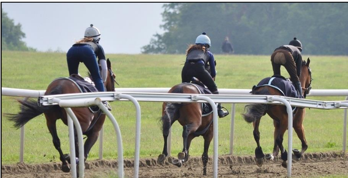
Three of our two year olds cantering up Warren Hill