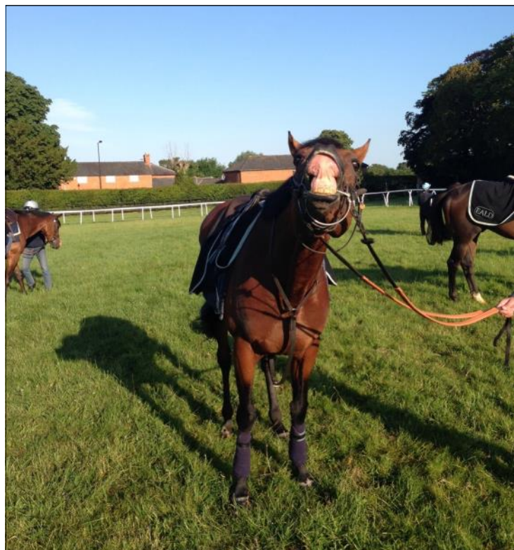
Joshua Tree smiling!