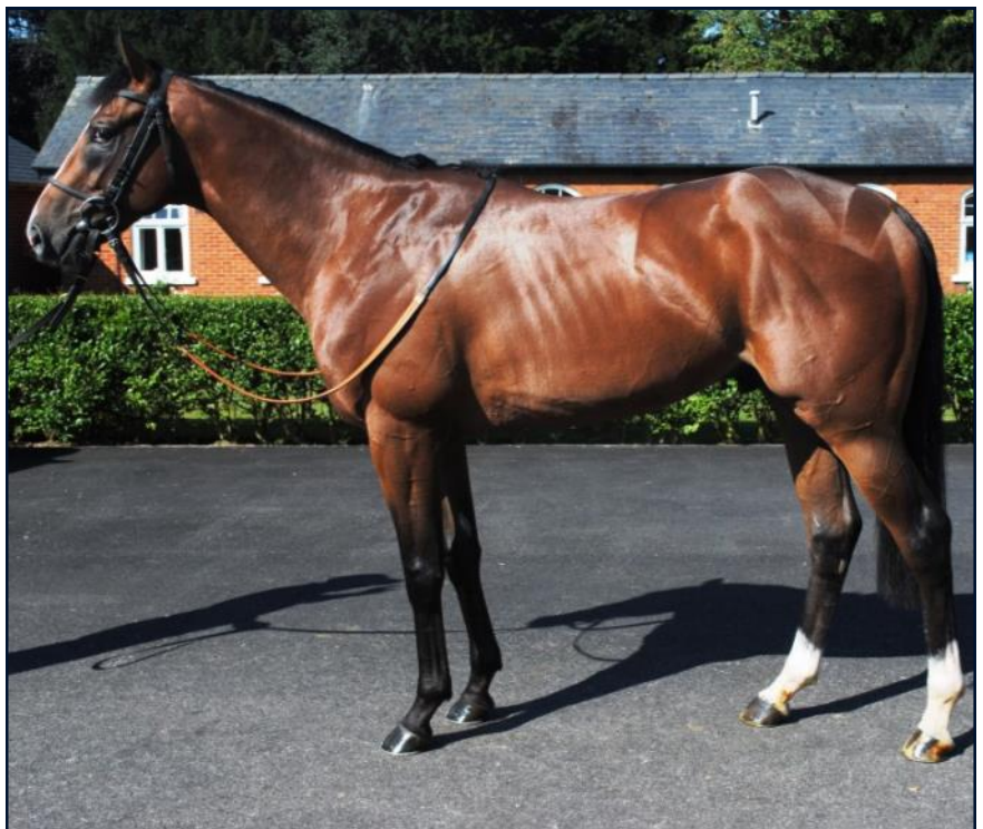
Trip To Paris gleaming

Trip To Paris won the Cainsbay Bloodstock Handicap by 1\frac{3}{4} lengths following up from a fantastic run in the King George V Stakes five weeks previously at the Royal meeting where he finished sixth of the eighteen runners. Ryan Moore dropped Trip To Paris in towards the rear of the field for the vast majority of the race, before coming wide in the straight with a blistering run. Trip To Paris is rather a cool customer here at La Grange Stables and he is proving to be a great Saturday horse for the yard and is one of the firm favourites with the lads. We are delighted for his owners, the La Grange Partnership and we hope he will carry on improving throughout the rest of the season.