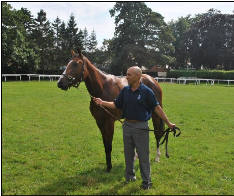
Arethusa having a pick of grass after her fantastic win