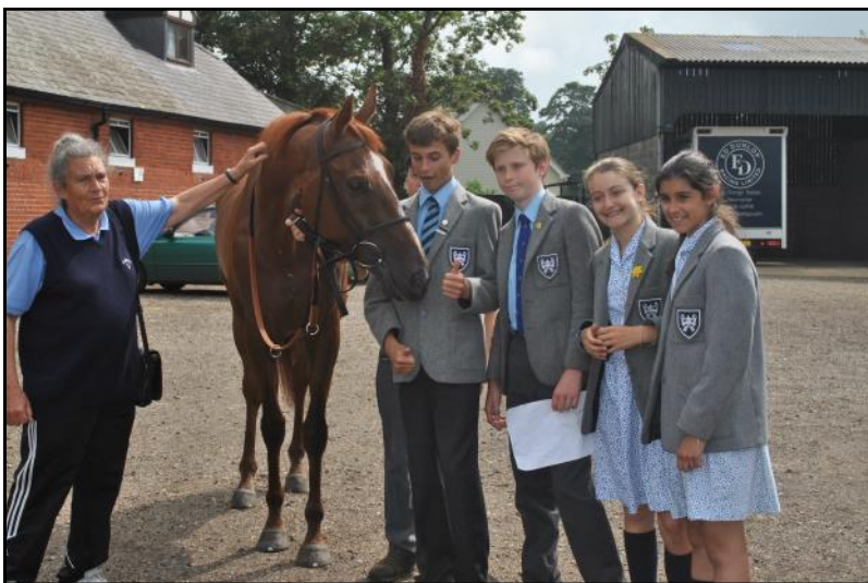
Red Cadeaux and Moreton Hall School pupils