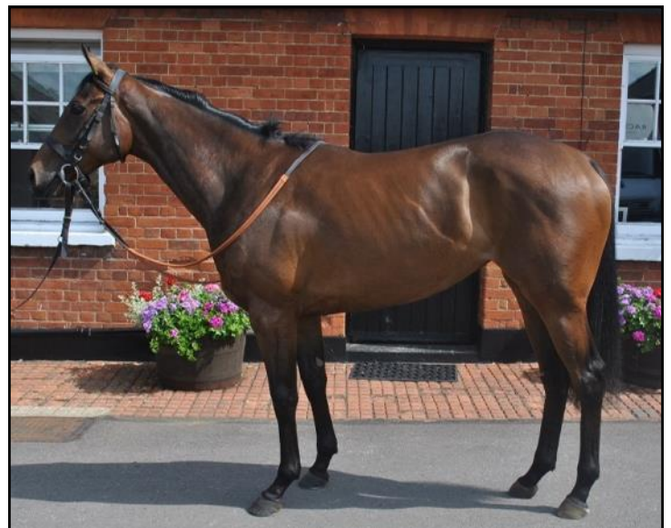
Ex Sharplaw Star

"This filly has been doing a few pieces of faster work. She is still growing so we will give her time to develop and we will hopefully see her running towards the back end of the season."