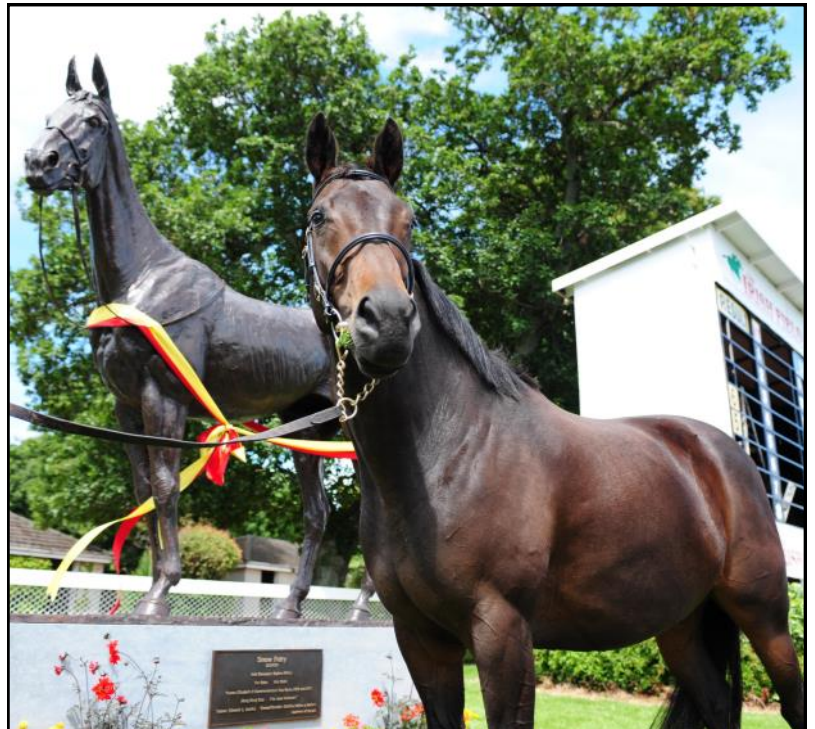
Snow Fairy with her life sized bronze statue