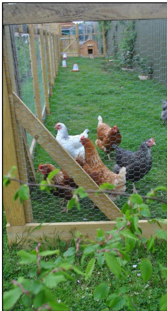
New residents at La Grange Stables