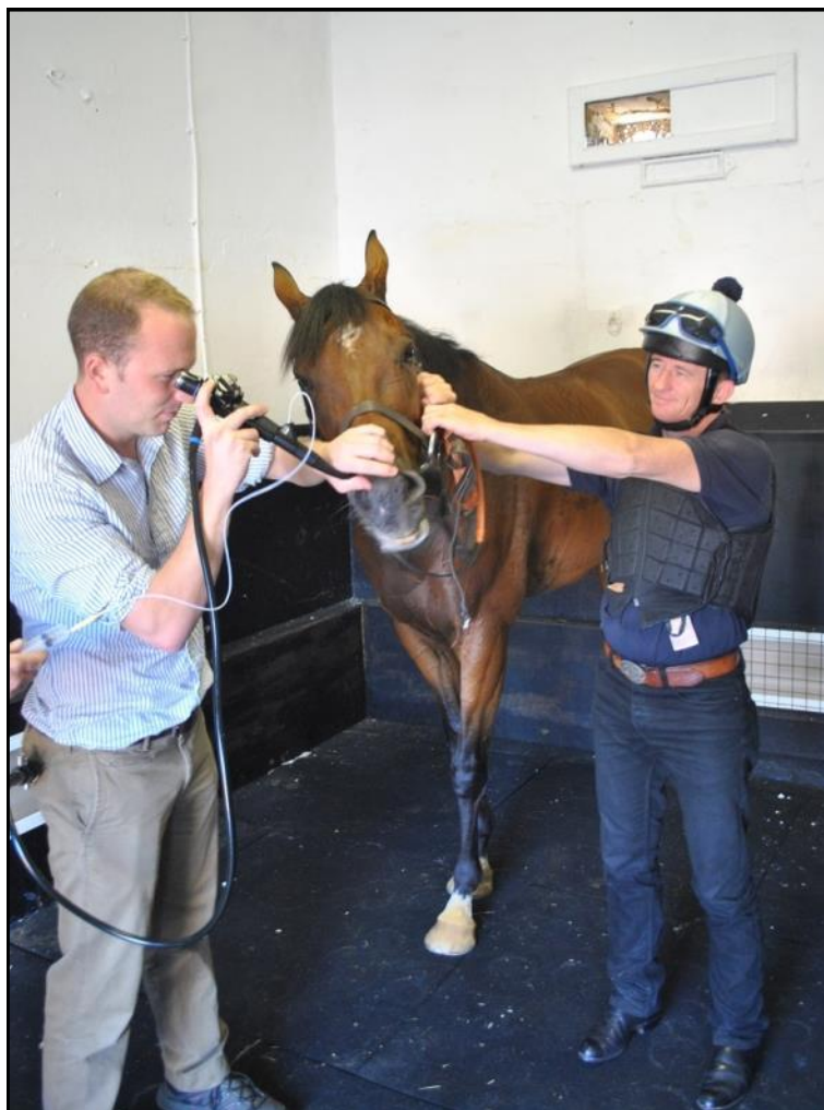
Romeo Monatgue being scoped prior to his run at Newbury