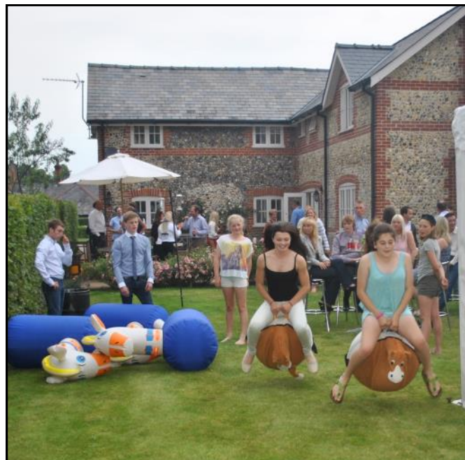
Staff summer party