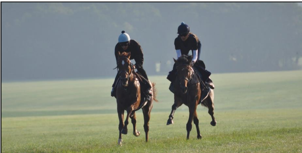
Beach Samba & Tom (far side) galloping with Feildsman & Jane (near side)