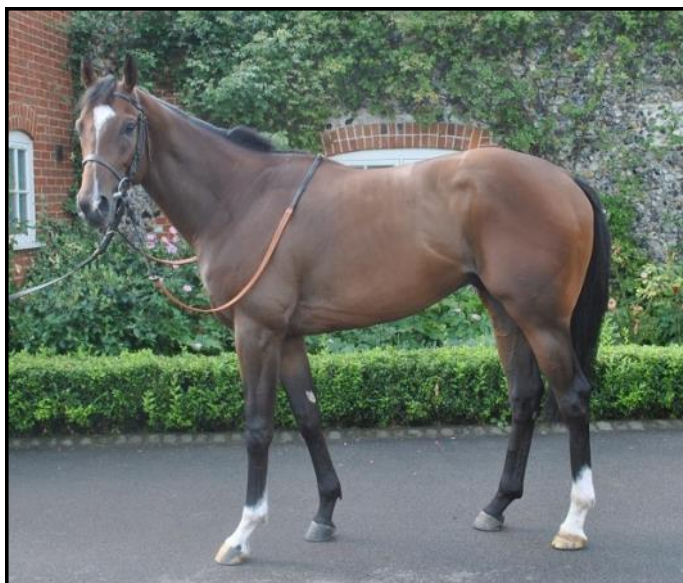
Souk Al Tahab

"Souk Al Tahab was bought at The Breeze Ups in Ireland. He is a typical Breeze Up horse and we are taking our time with him so he learns to relax. He looks a sharp horse who has plenty of scope."