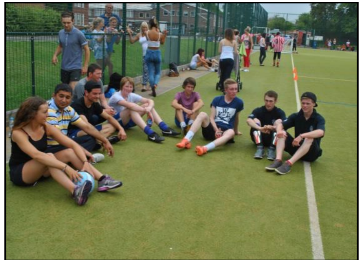
The Dunlop football team at The Astley Club 5 a side competition