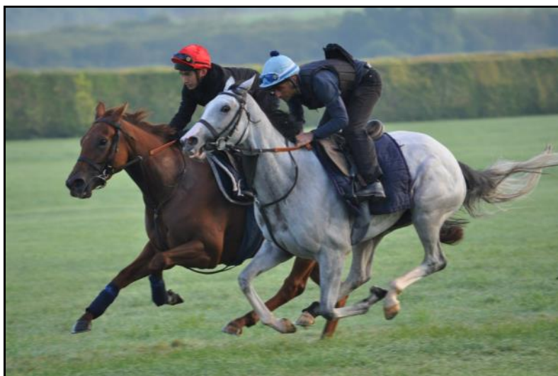
Palace Princess (Red Cap) galloping with Loch Ma Naire